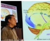
All images are from Serpentine's Marathon in 2007.

One of the highlights of the Reykjavik Arts Festival will be the Experiment Marathon Reykjavik, an exhibition and program of related events organized by the Reykjavik Art Museum and the Serpentine Gallery, London. Lasting from 15 May through August 17, the focus of the project is experimentation. The RAM will become a laboratory in which leading artists, architects, film-makers, and scientists will create an environment of invention through a series of installations, performances and experimental films. Additionally, previous related projects will be presented as archives within the exhibition. The exhibition and related events are curated by Hans Ulrich Obrist, Co-Director of Exhibitions and Programmes and Director of International Projects, Serpentine Gallery, London, in collaboration with artist Ólafur Eliásson.